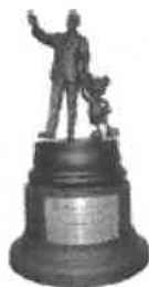
Walt Disney World® Resort PARTNERS AWARD